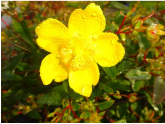
Owen Reid, P4